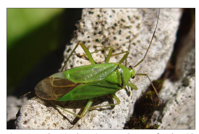
Figure 2: Calocoris alpestris, a true bug, prefers humid, partly shady microclimates, dominated by herbs (PICTURE: T. FRIESS/ÖKOTEAM).

An analysis from a conservation point of view on Red List and endemic species shows semi-open areas being with nine valuable species richer and lying ahead of open areas with seven and forest stands with only three of those species. Habitats in an transitional phase, mostly rich in structural elements are therefore of high importance for the survival of rare and endangered true bug species, as well as for other species of the alpine fauna.