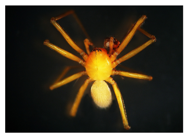
Figure 3: Troglohyphantes noricus is sub-endemic in Austria and one of the demanding inhabitants of crevices and undisturbed habitats, which declined because of the use as high pastures (PICTURE: CH. KOMPOSCH/ÖKOTEAM, STYRIA, GESÄUSE).